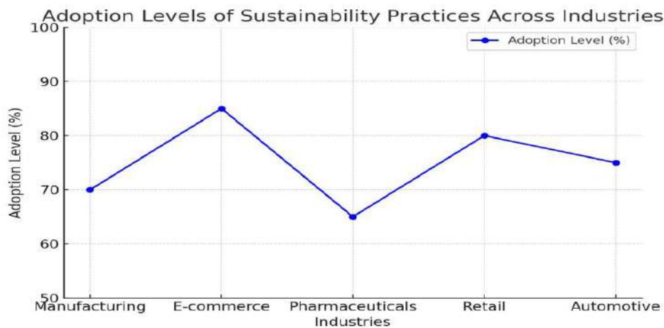
(Line graph showing average adoption scores of sustainability practices across industries.)

A line graph illustrating these adoption levels is shown below.